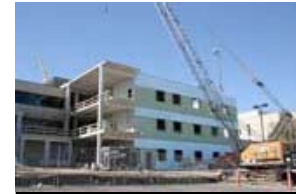
Construction in Washington County

Click on a community on the map below to learn more.