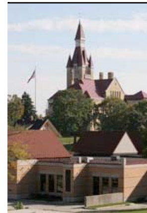
Downtown West Bend